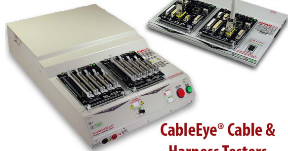
CableEye® Cable & Harness Testers

CAMI Research produces expandable and upgradable diagnostic Cable & Harness Test Systems for assembly, prototyping, production, and QC of standard or custom cables. CableEye® Testers display, and document basic electrical properties such as continuity, resistance, dielectric breakdown, insulation resistance, miswires, and intermittent defects. camiresearch.com